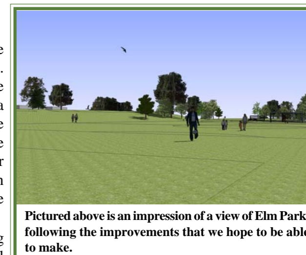
Pictured above is an impression of a view of Elm Park, following the improvements that we hope to be able to make.