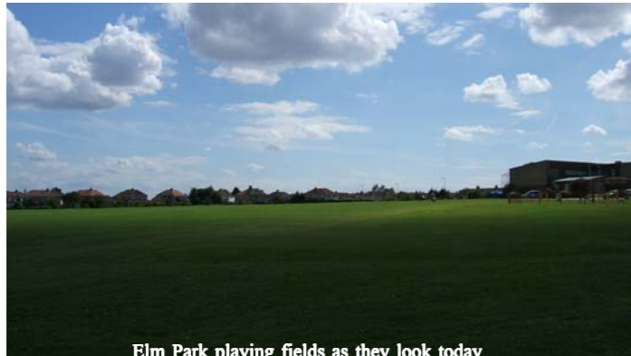
Elm Park playing fields as they look today

We have mentioned the Council's plans for both the buildings and the fields at Elm Park in issues of Town Council News since April 2006. In this issue we explain them further and address some of the questions and concerns that have been raised with us so far about the delivery of these plans.