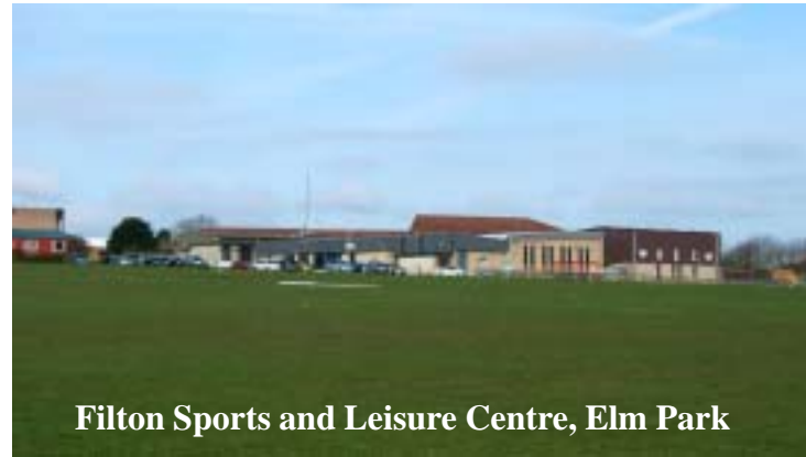
Filton Sports and Leisure Centre, Elm Park

The Council has therefore commissioned a feasibility study to look at how the centre could be developed to improve facilities for current users and to attract new ones. The study looks at the whole of the centre, it suggests that a new changing village could be built nearer to the field and the current changing area redeveloped to add more space for parties and meetings or into a bar and the current Ratepayers Arms used differently. It also considers turning the remaining squash court into 2 rooms by putting a floor in to create an upstairs room and using the downstairs one as a games room with access from the Ratepayers Arms if it remains in its current position.