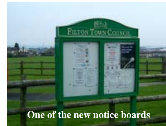
One of the new notice boards

In order to increase the availability of information about the council and forthcoming events, the council is increasing the number of notice boards in the town and replacing old and worn out ones.