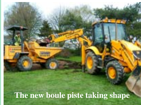
The new boules piste taking shape

In the last issue of Town Council News we reported on plans to redevelop the fields at Elm Park and to add new facilities and vastly improve existing ones. Work on planning the cycle speedway track is going well and we are on track to stage an opening match on Sunday 9 th July as part of the Filton Community Festival. It is hoped that the first meeting will take the form of an International battle between England and Poland.