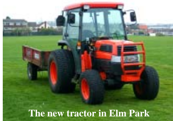
The new tractor in Elm Park

In the last year it has been necessary to renew the tractor and cutters at a cost of £28,365. The council owns the fields at Elm Park, the Northville Millennium Green and the piece of land known as the land behind the Bulldog.