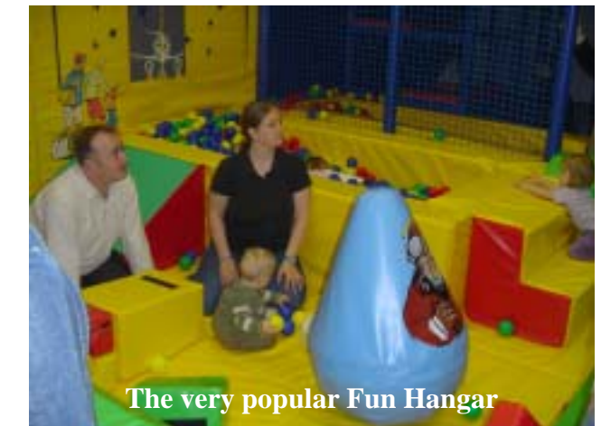
The very popular Fun Hangar

In May 2005 the Centre changed its Name for one day and became Holby Sports and Leisure Centre as an episode of the popular BBC drama series Casualty was filmed at the Leisure Centre.