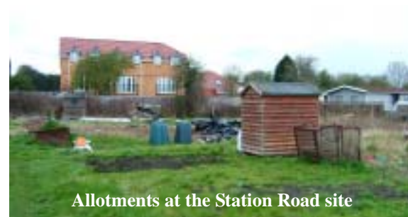
Allotments at the Station Road site

In addition the council is pleased to be able to announce that we are very close to reaching an agreement with Bristol City Council to take over the management of the Station Road Allotments. The City Council had considered selling the land for development, but with the help of members of the City Council, we secured agreement on a lease, which will be at a very low cost to the Council.