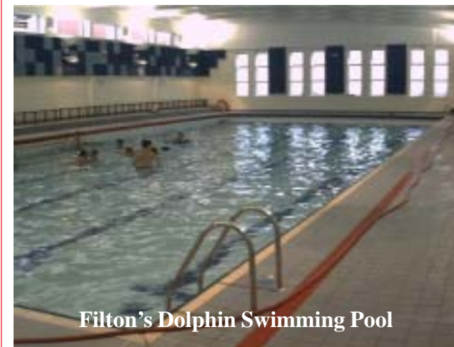
Filton's Dolphin Swimming Pool

The leisure Centre runs 103 lessons per week the most it has ever run with approximately 780 children attending each week.