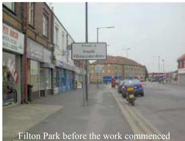
Filton Park before the work commenced

Filton Town Council has been co-ordinating the regeneration group that has been responsible for deciding how to spend the money that has been made available by South Gloucestershire Council for Filton Park. The improvements will include new lighting, reduction in signs, seats and litter bins. The group are still investigating a cheaper landscaping scheme for the car park than originally proposed and a small scheme to tidy up the green at the entrance to Gaynor Road. Some Christmas lights will be going up on the lamp posts in Filton Park this year and the