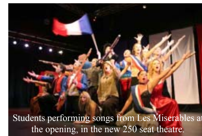
Students performing songs from Les Miserables at the opening, in the new 250 seat theatre.

The centre, as part of the whole Filton College set up will give Filton young people real opportunities in sport, art and the performing arts unrivalled in other parts of the region. It is also available for the community and Filton Male Voice Choir have already taken advantage of one of the music rooms for their weekly practice sessions.